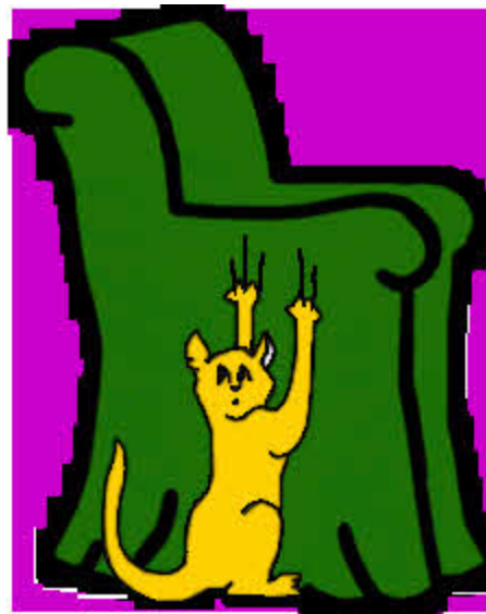
A cat claws a chair.

Declawing (also known as onychectomy) has probably become the most controversial of all the elective surgical procedures commonly performed by veterinarians. While it is normal for cats to scratch things (to mark territory as well as to condition their claws) this behavior can destroy the bond between an owner and pet cat. Cats, especially adolescent cats, tend to play rough, scratching their owners or other pets sometimes violently in play. Claws serve to mark territory and assist in communicating territorial messages to other cats though this behavior can be undesirable when it is directed against furniture. The declaw surgery is an instant permanent solution to these problems; however, it is popularly held that a number of adverse conditions result from declawing, possibly including chronic pain for the cat. Pet owners need an understanding all of the alternative options involved as well as what the actual facts are regarding this procedure.